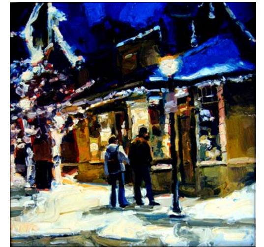
Kelly Kotary Window Shopping 16 X 16 Oil 9th Annual Holiday Art Exhibition at the CAC